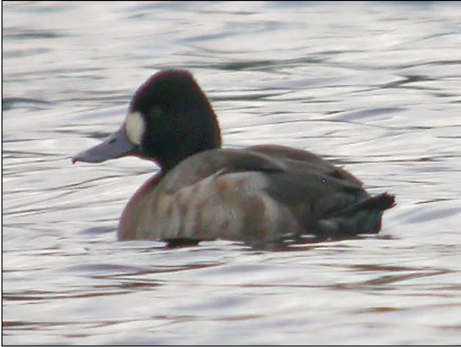
Both photos. Adult female Lesser Scaup Aythya affinis , Mill Pond, Shrigley, Killyleagh, County Down, 25th November 2007.