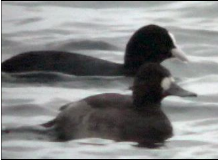
First winter female Lesser Scaup Aythya affinis , Clea Lakes, Shrigley, Killyleagh, County Down, 9th December 2007.