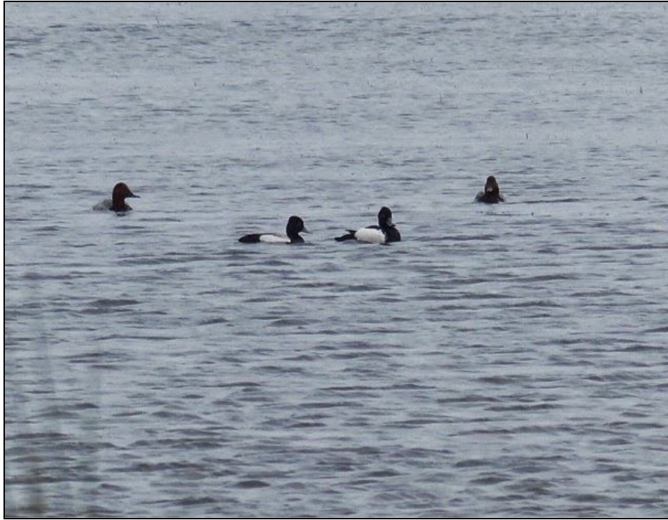
Lesser Scaup Aythya affinis Male, Lough Beg NNR, County Londonderry, 12th June 2014, photograph courtesy of Jeff Larkin