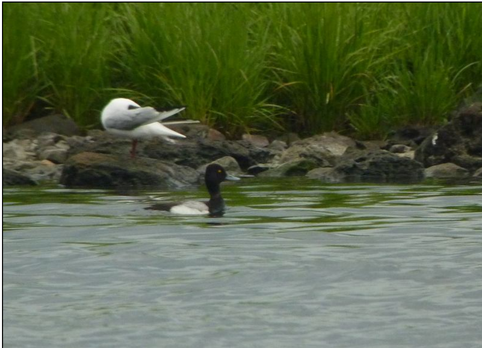
Lesser Scaup Aythya affinis Adult male. Lower Lough Erne Islands RSPB Reserve, Kesh, County Fermanagh, 7th June 2016