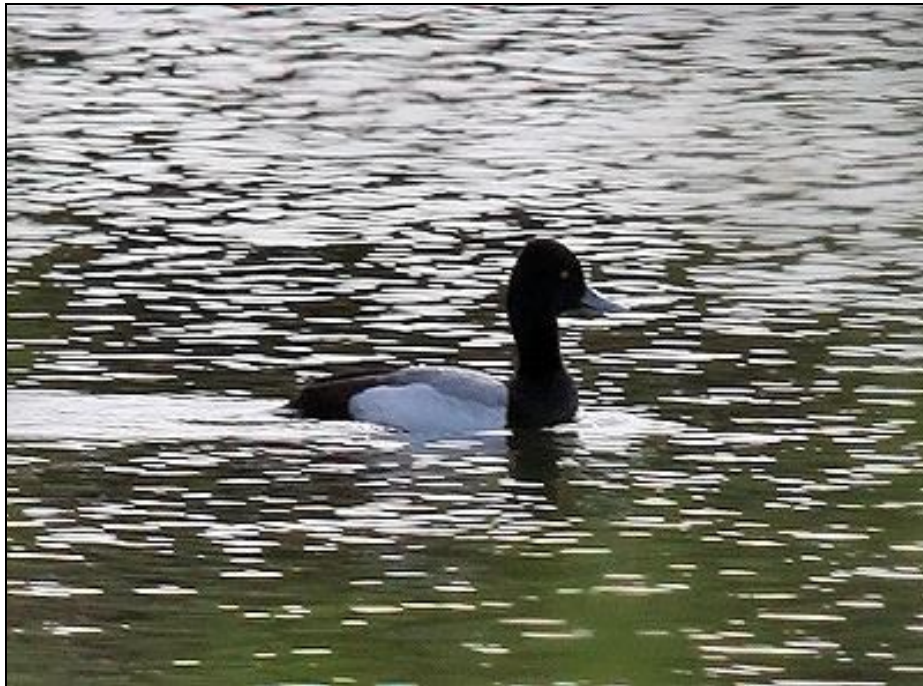
Lesser Scaup Aythya affinis Lough Shark, Poyntzpass, County Armagh, 4th May 2013.