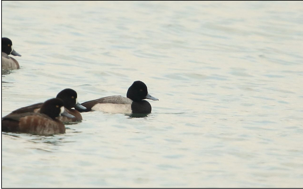
Lesser Scaup Aythya affinis Adult male. Airport Road West, Belfast Lough, Belfast, County Down, 19th January 2017.