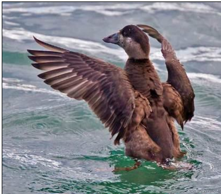
Carnlough Harbour, Carnlough, County Antrim, 7th November 2012.