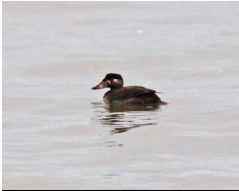
First-winter male. Garron Point, Carnlough, County Antrim, 1st January 2014.