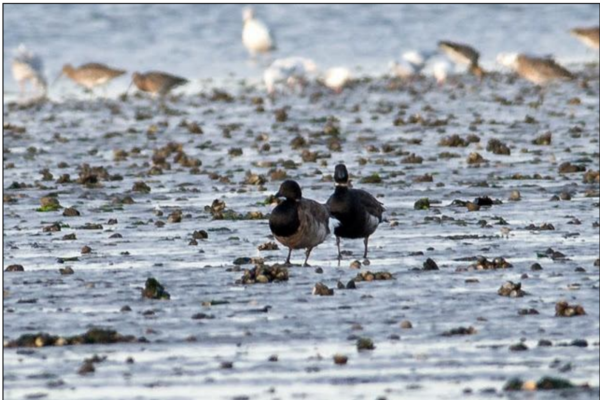
Black Brant Branta bernicla nigricans, Kinnegar Shore, Belfast Lough, Holywood, County Down, 5th October 2013.