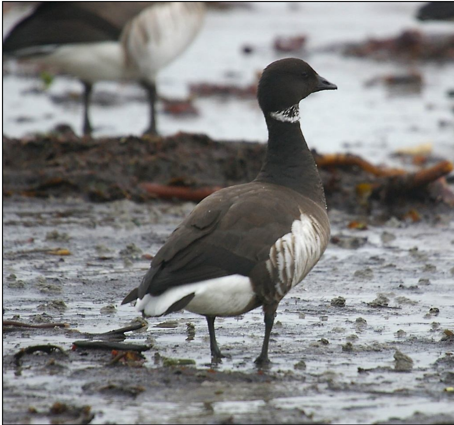
Black Brant Branta bernicla nigricans , Millisle, County Down, 8th February 2008.