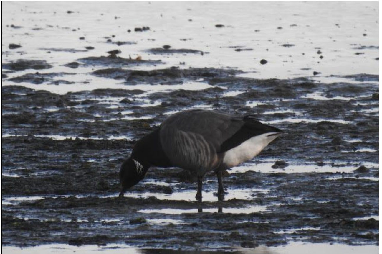
Dundrum Inner Bay, Newcastle, 14th November 2019.