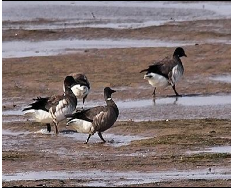
Dark-bellied Brent Goose Branta bernicla bernicla, Balla Point County Londonderry, 2012.