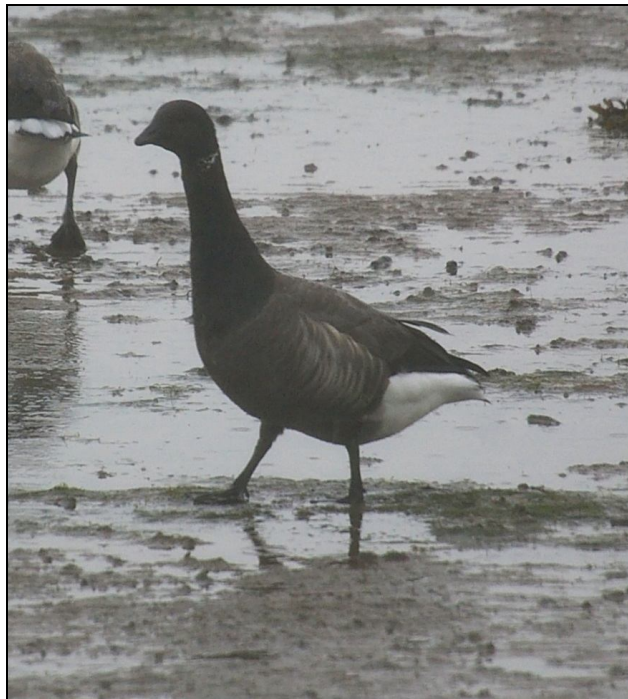
Dark-bellied Brent Goose Branta bernicla bernicla, Strangford Lough, County Down, 2010.