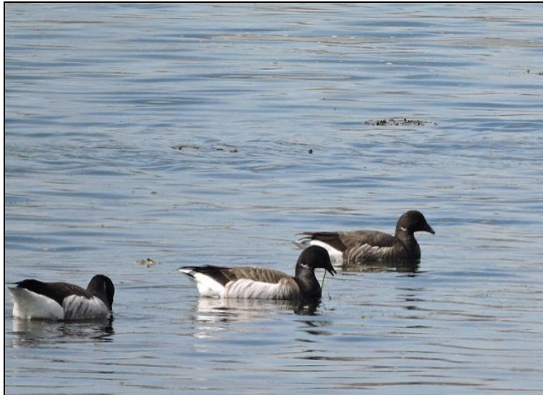
Dark-bellied Brent Goose Branta bernicla bernicla, Mill Bay, County Down, 2017.