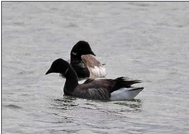
Dark-bellied Brent Goose Branta bernicla bernicla, Killard, County Down, 2013.