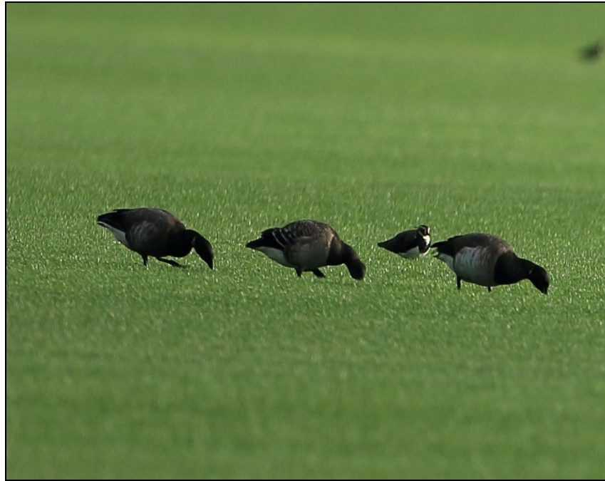
Dark-bellied Brent Goose Branta bernicla bernicla, Myroe Levels, County Londonderry, 2015.