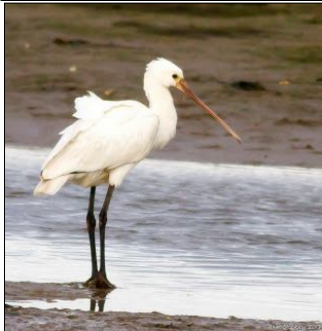
All photos courtesy of Ian Dickey, Castle Espie, Down, 2013.