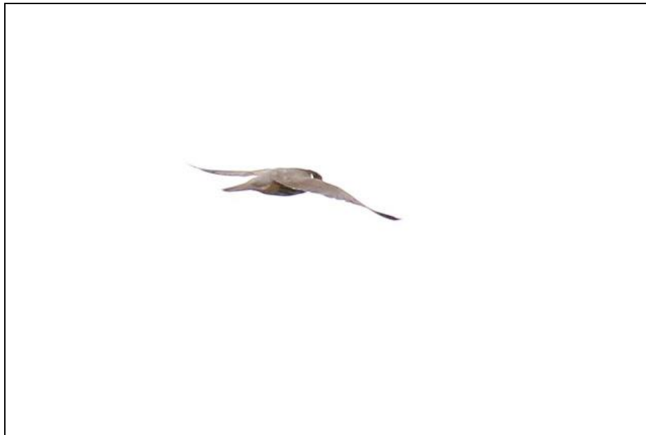
Antrim Hills, County Antrim, 11th June 2019.