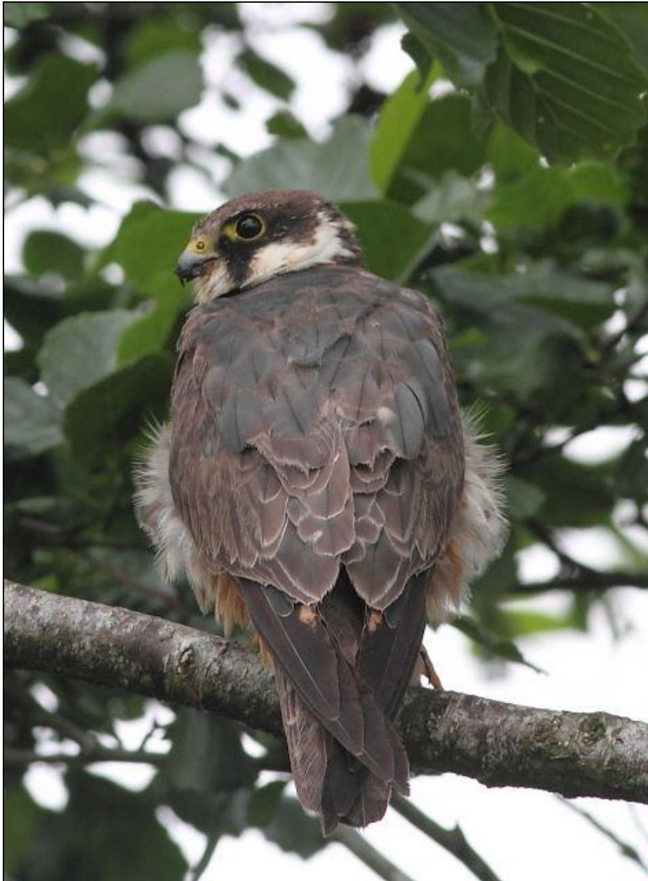
Montaighs Moss, Aghagallon, County Antrim, 25th July, 2011.