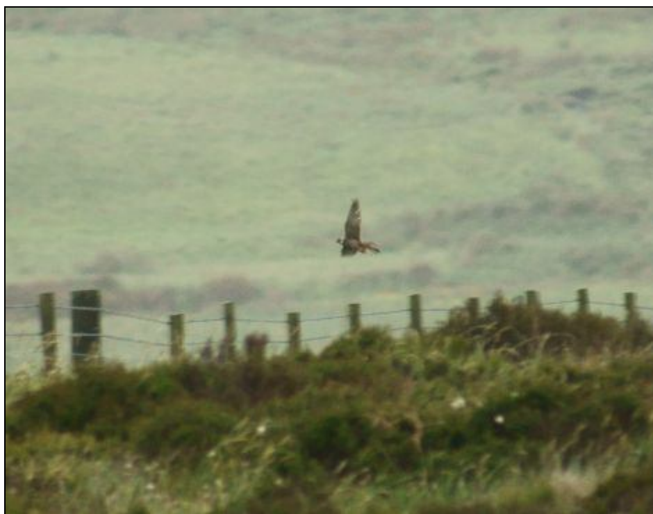
Slemish, Ballymena, County Antrim, 18th June 2012.