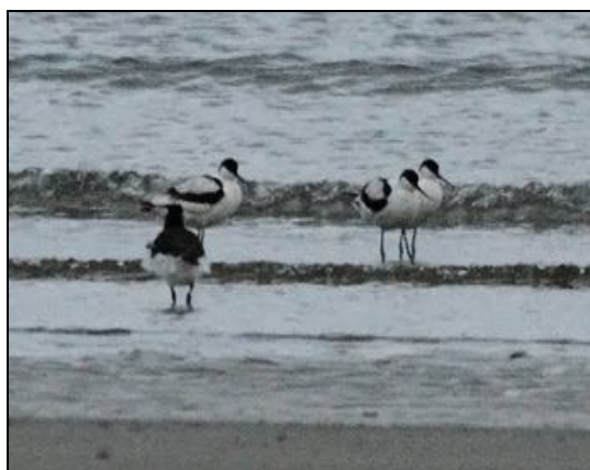
Knockenelder Bay, Kearney, Outer Ards Peninsula, County Down, 10th September, photo. Ronald Surgenor.

Three: Probably first-year males. Knockenelder Bay, Kearney, Outer Ards Peninsula, County Down, 10th September, photographed (Keith Bennett et al. ). Charles and Croy 2019.