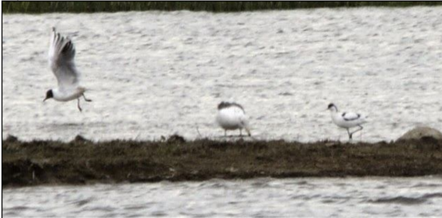
Quoile Pondage NNR, Downpatrick, County Down, 6th May 2014