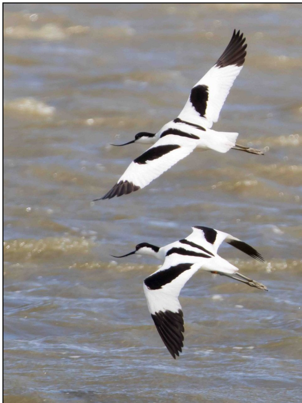
Avocet Recurvirostra avosetta Belfast Lough RSPB Reserve 25th April 2017.