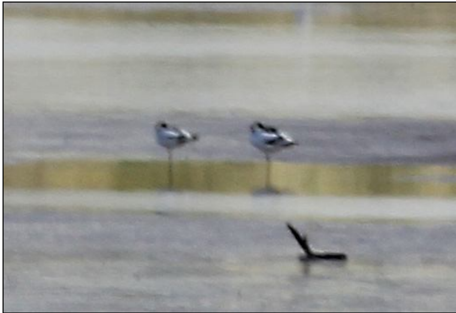
Bann Estuary, Coleraine, County Londonderry, 28th April 2018.

Four: Two pairs. Bann Estuary, Coleraine, County Londonderry, 28th April (Theo Campbell et al. ). Charles and Crory 2019.