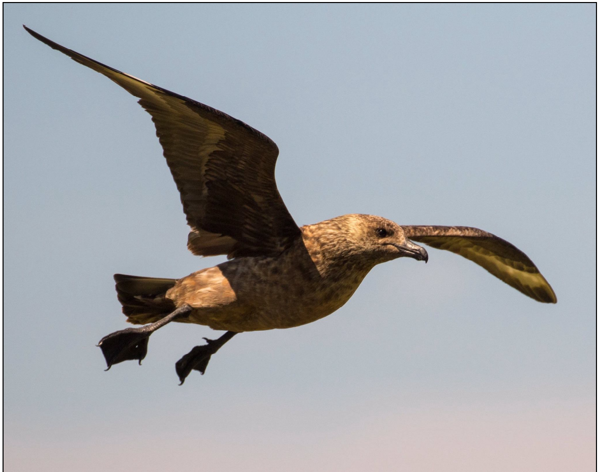
Rathlin Island 2019. Photo courtesy of Ian Dickey.

One: Magilligan, 6th September (Mervyn Campbell).