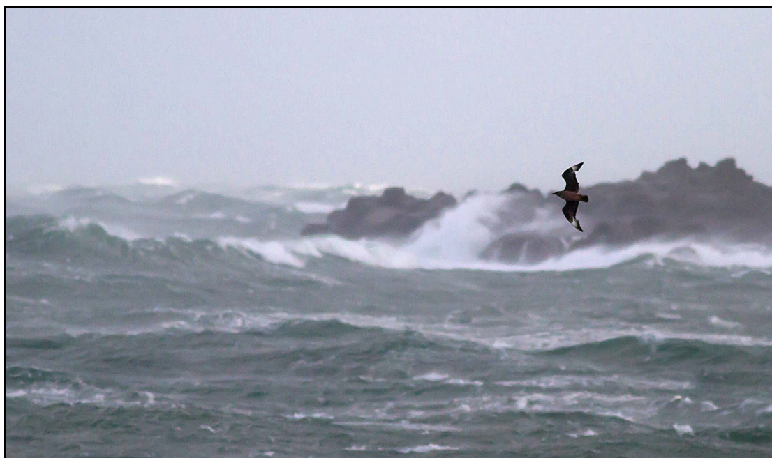
25th October 2014, Ramore Head Portrush.

One: St. John's Point, Killough, 14th September.