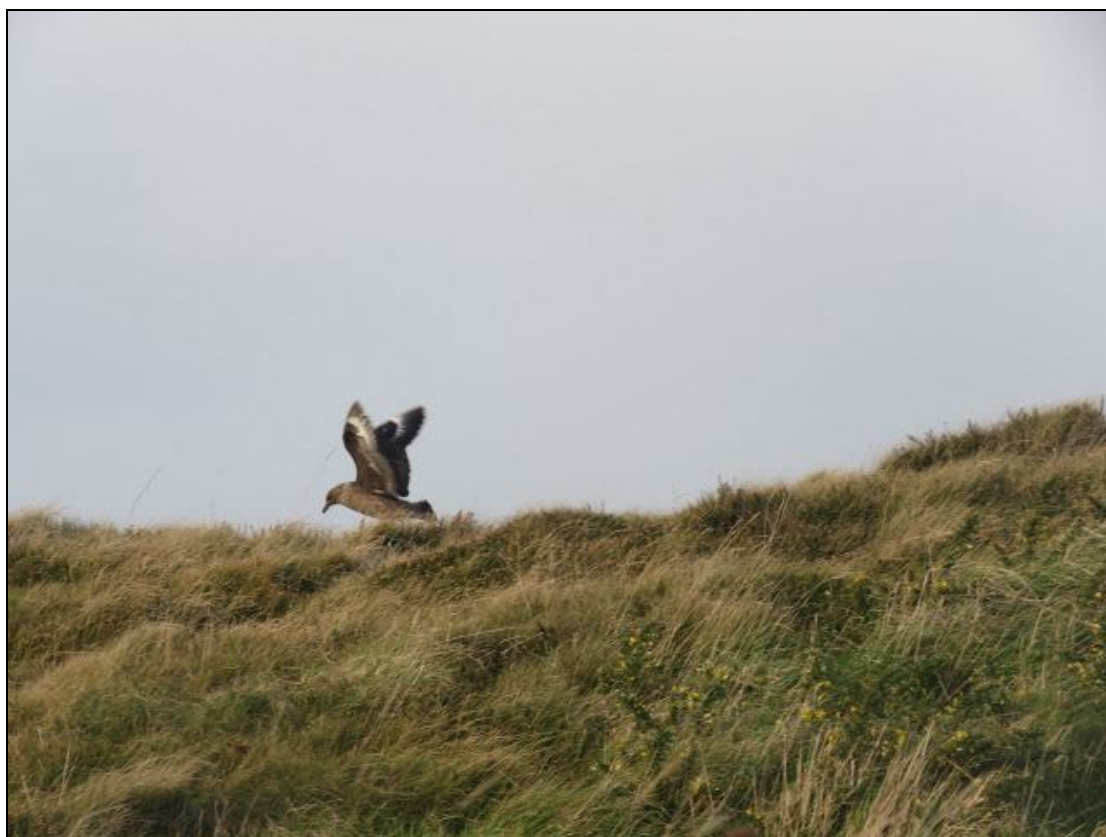
Ballymacormick Point, Groomsport, 27th January 2016.

Eight: Burial Island, Portavogie; three 4th September with five on 23rd October (Richard Weyl, Billy Miskelly).