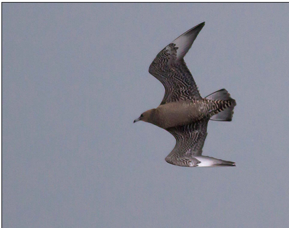
Ramore Head, Portrush; 21st October 2014.