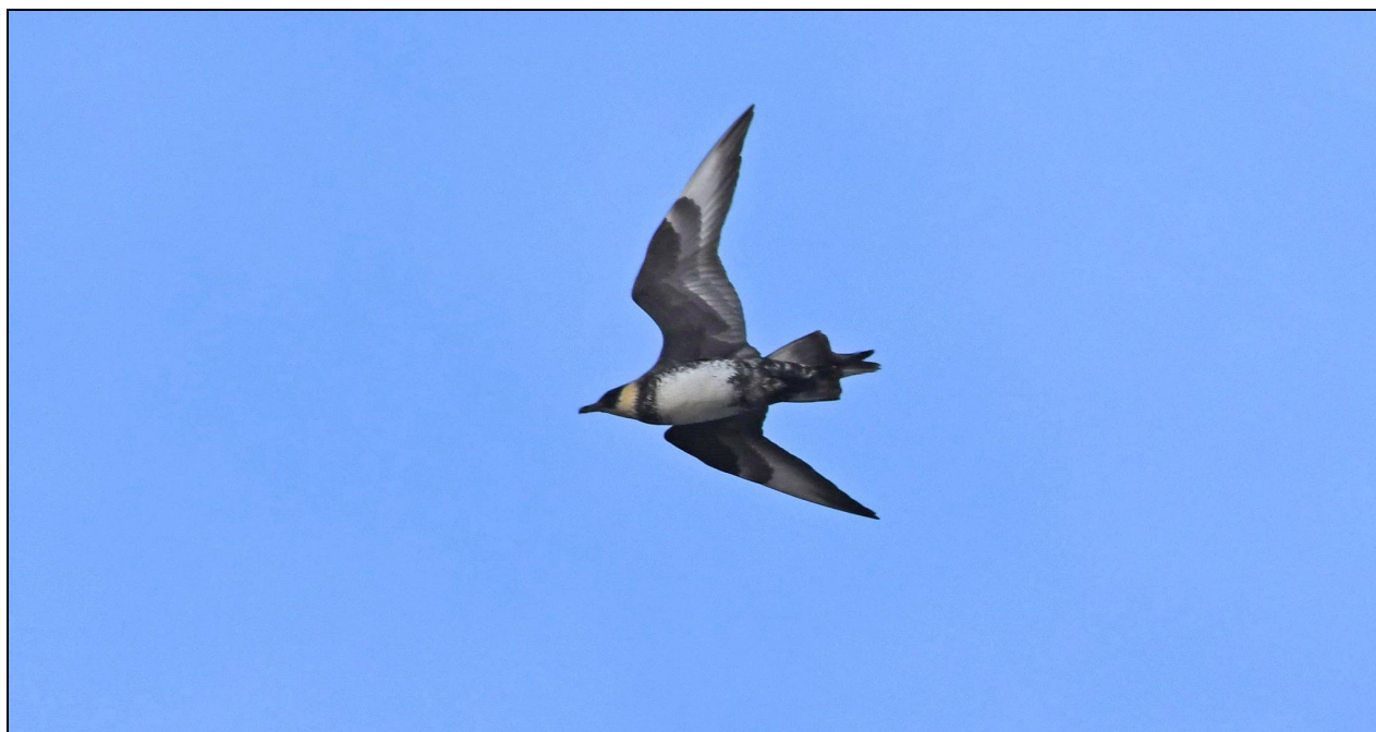
Magilligan, Lough Foyle, 6th September 2019.

One: Magilligan, Lough Foyle, 6th September.